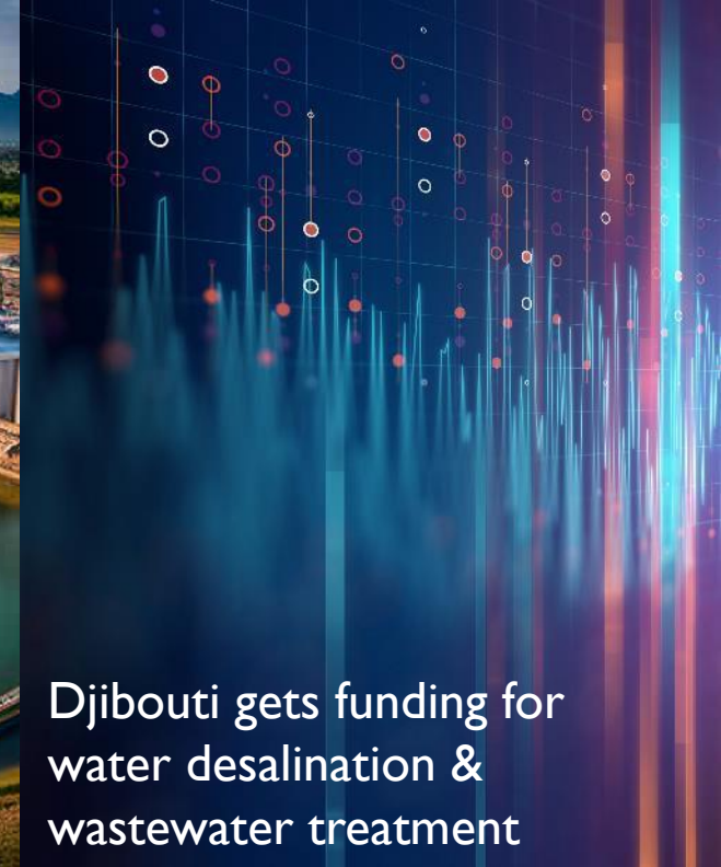
Djibouti gets funding for water desalination & wastewater treatment