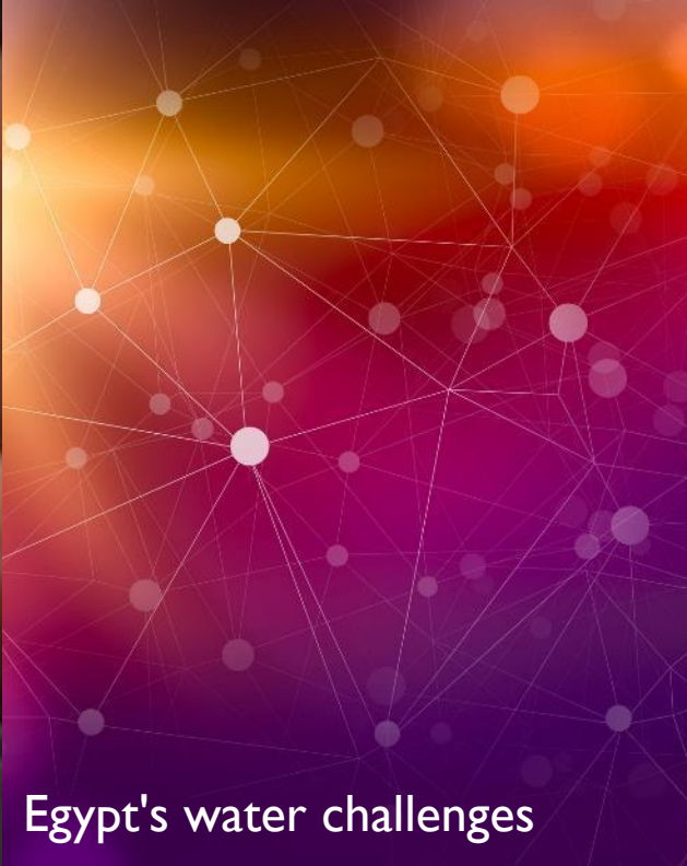
Egypt's water challenges